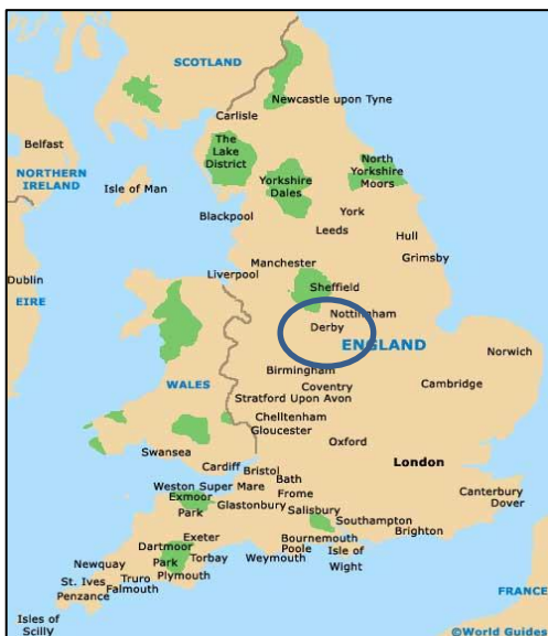
Map shows the county of Derbyshire in the UK

"I've always been very well looked after," said Ian. LPG has provided Ian with exceptional catering capabilities